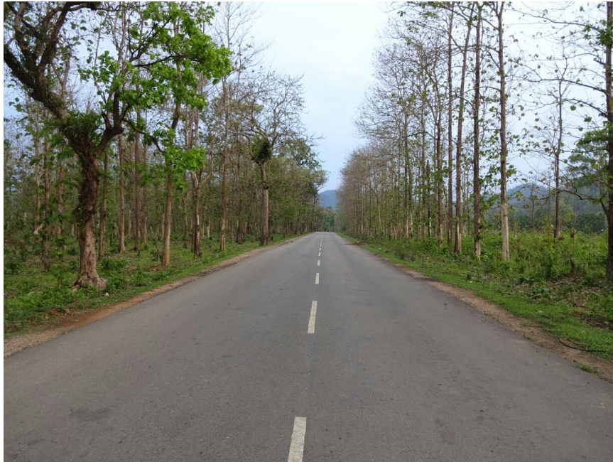
NH 62 and Reserve Forest