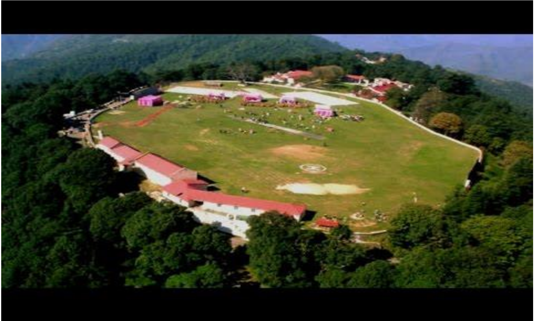
Gram Panchayat Chail