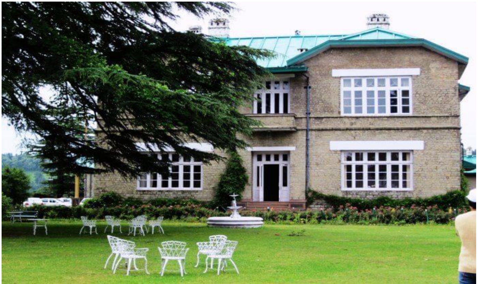
Gram Panchayat Chail