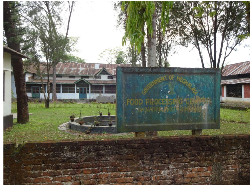
Food Processing Centre