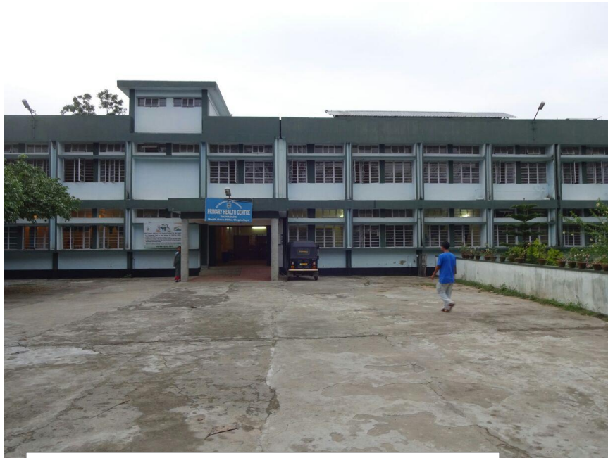
Primary Health Centre