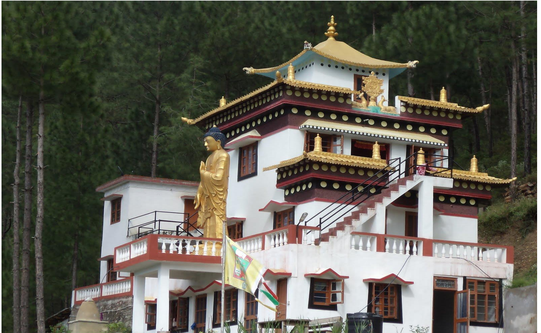
Gram Panchayat Sakori