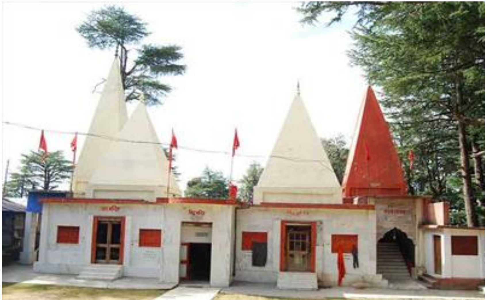
Gram Panchayat Chail