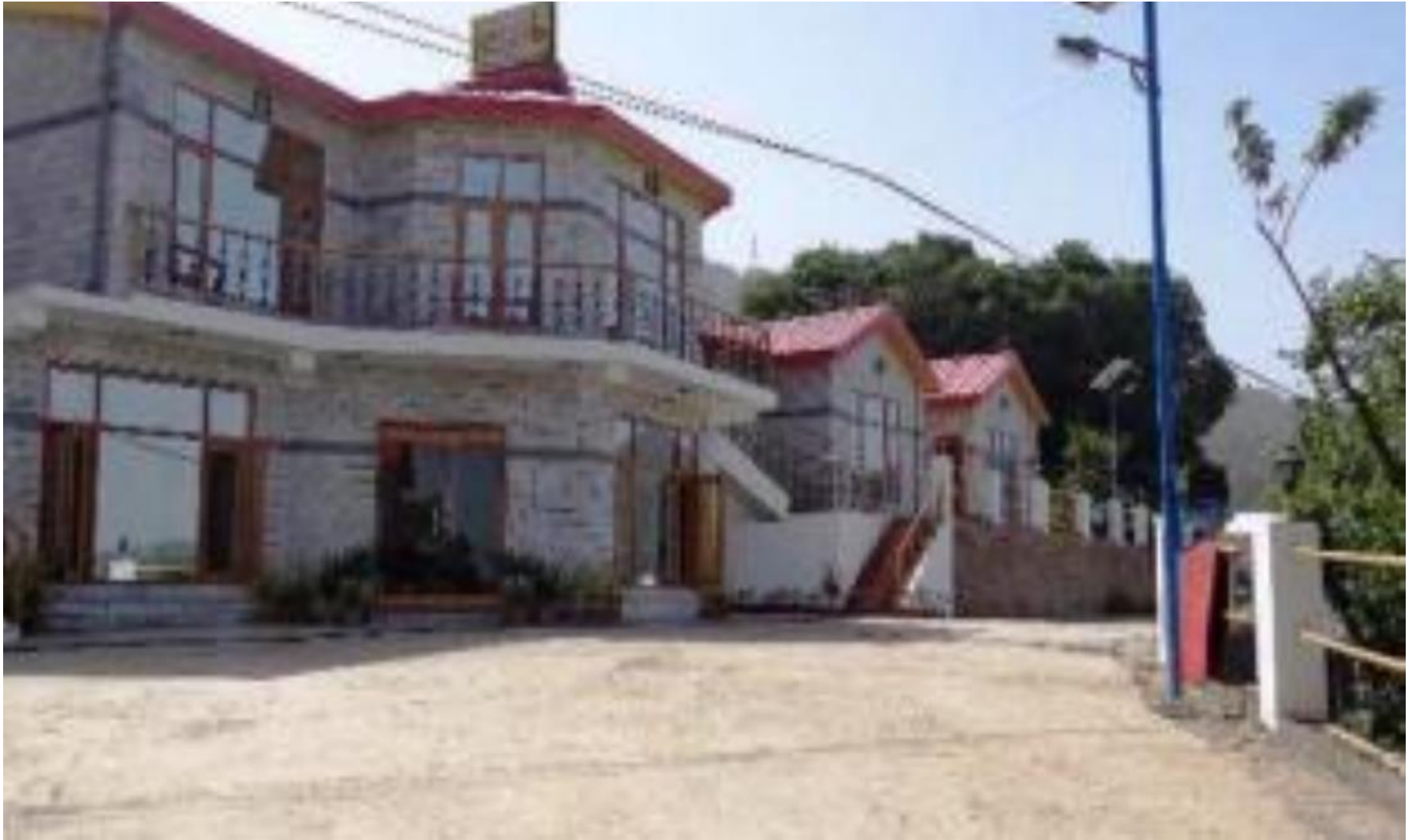
Gram Panchayat Jhaja